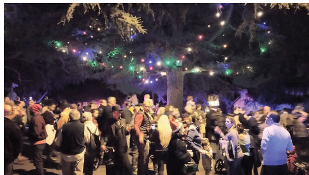
Largest Ceremony Turnout